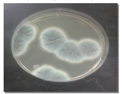
Fig.(2): Penicillium notatum.