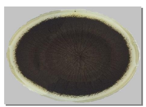
Fig.(1): Aspergillus niger.