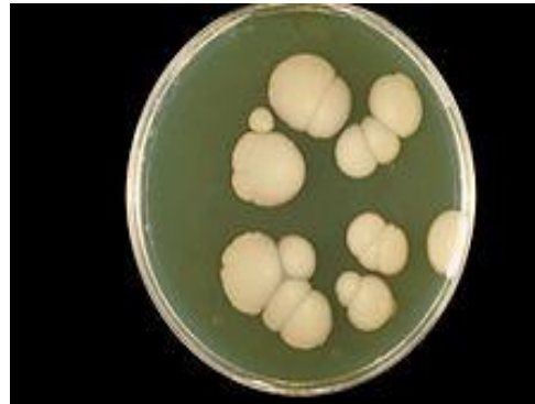
Fig.(3): Candida sp.